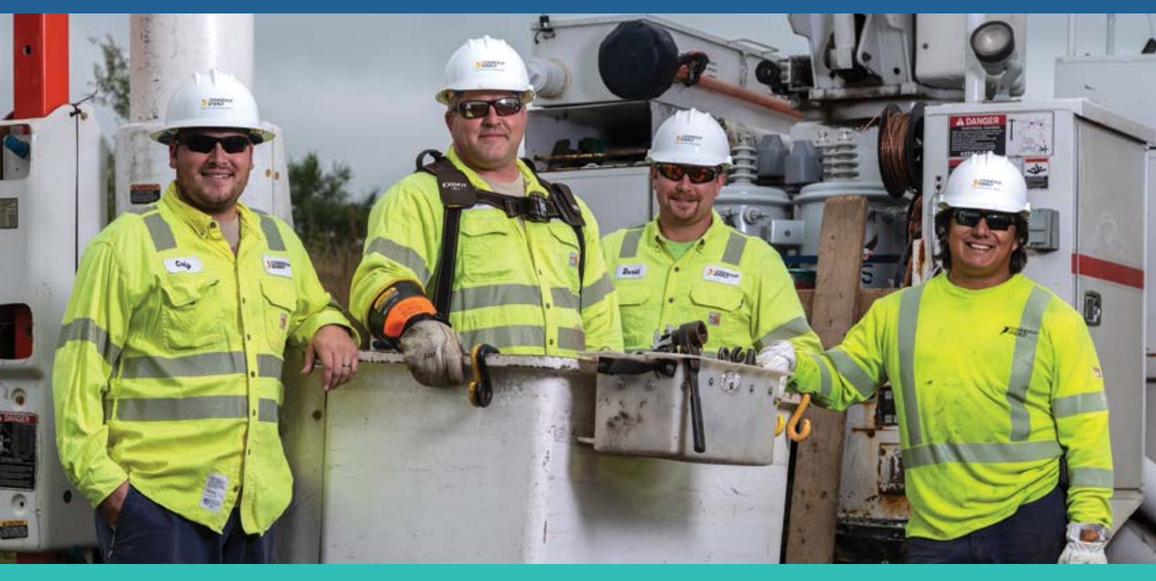
THIS IS US